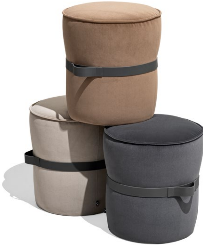
Pof CB5207 pouf | tessuto Mat SLQ grigio - SLJ sabbia - SLK cammello - ottomans | Mat fabric SLQ grey - SLJ sand - SLK camel brown Cozy CB2135 sedie | metallo P33L ottone verniciato / tessuto Mat SLN rosa - chairs | metal P33L Painted Brass / Mat fabric SLN pink Dorian CB4815-R 160 B tavolo allungabile | metallo P94 bianco ottico opaco / ceramica P17C marmo bianco alpi - extending table | metal P94 matt optic white / ceramic P17C white alpi marble