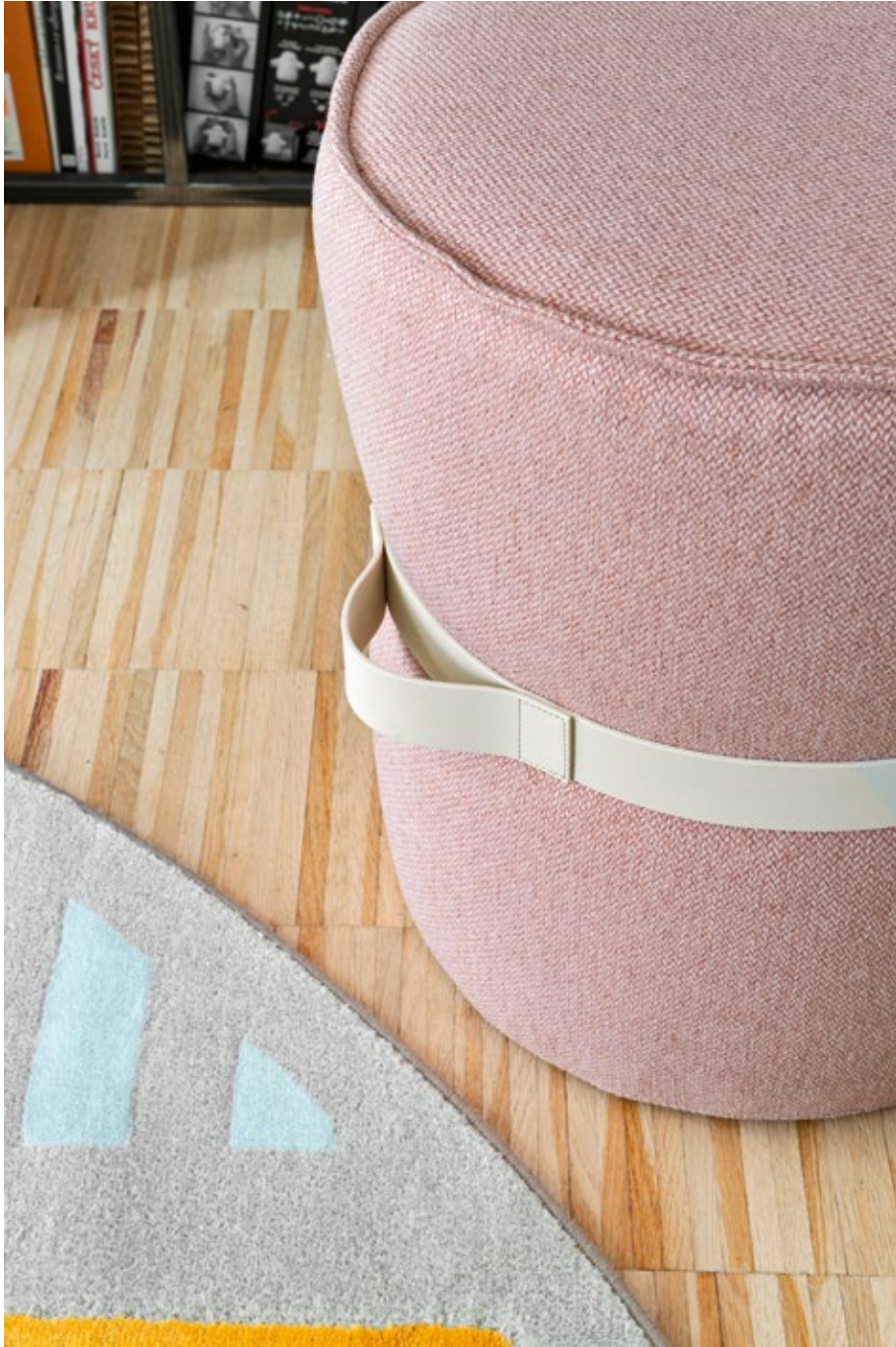
Pof CB5207 pouf | tessuto Cros SLD zafferano - SLE rosa - ottomans | Cros fabric SLD saffron yellow - SLE pink Hachiko CB7254-C tappeto | polipropilene/poliestere tonalità beige/timo/zafferano/limone - rug | polypropylene/polyester various shades of beige/thyme green/saffron yellow/lemon yellow